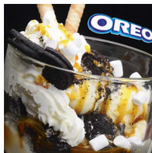
Fancy a treat? Why not try our amazing, new home-made ice-cream Oreo sundae?

All prices are inclusive of VAT at the standard rate. We insist on fresh ingredients of the highest quality - should any of these become unexpectedly unavailable, our ability to offer some menu items may be affected.