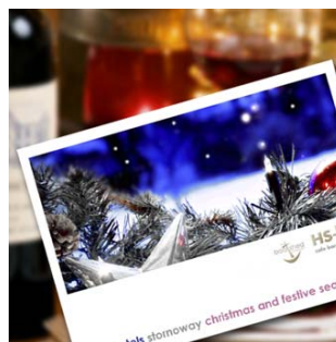
Flaming June. It's not too early to book for Christmas lunch - please ask for a brochure.